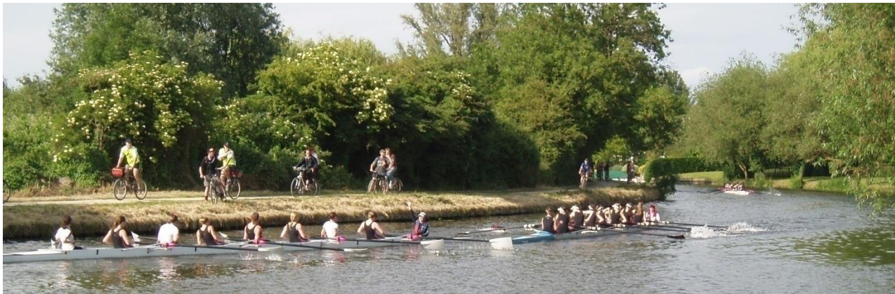
Coxing Bumps Races - Seniors